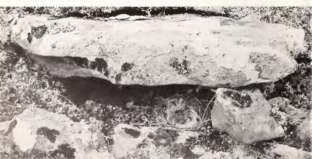
Fig. 23. Snow bunting nest on windswept ridge; Cape Peirce, 24 June 1970.

Pairs were found on the coast along cliffs and screes (18–300 m asl). Inland, they were 800–1200 m asl (and occasionally as low as 550 m asl) in dwarf shrub mat on screes, cliffs, and fell-fields. We found low numbers of breeding birds (<1.0 pairs per linear kilometer) at the Tuluksak River on summit ridges and plateaus. At old tailings along the Salmon River near Platinum, we found 38 scolding pairs per square